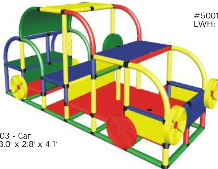
#500103 - Car LWH: 8.0' x 2.8' x 4.1'