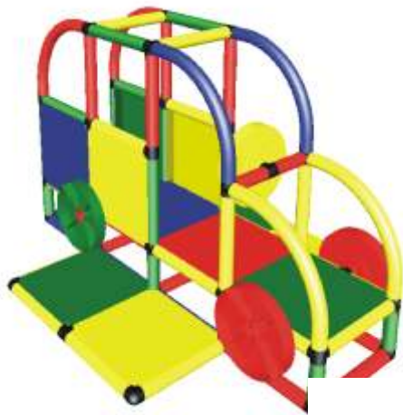
#500104 -SUV LWH: 5.4' x 4.1' x 4.1'

WHEELS The large black floating wheels are no longer be available but have been replaced by the equally durable "Multi-wheel"