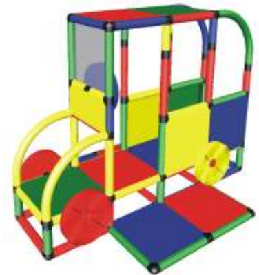
#500102 - Van LWH: 5.4' x 4.1' x 4.1'