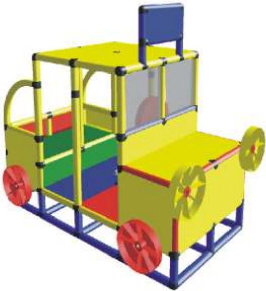
#500100 - Bus LWH: 5.4' x 2.8' x 4.8'