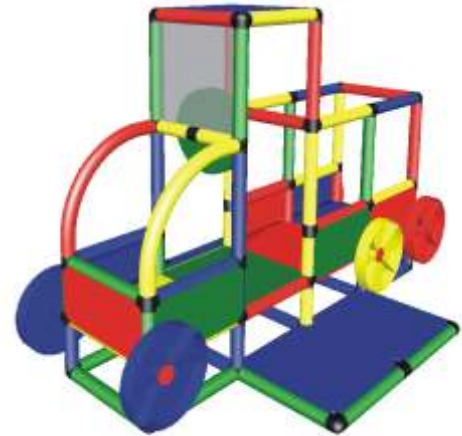
#500101 - Truck LWH: 5.4' x 4.1' x 4.1'

WHEELS The large black floating wheels are no longer be available but have been replaced by the equally durable "Multi-wheel"